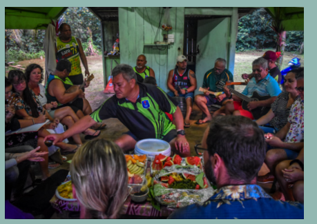
No visit to Atiu is complete without a visit to