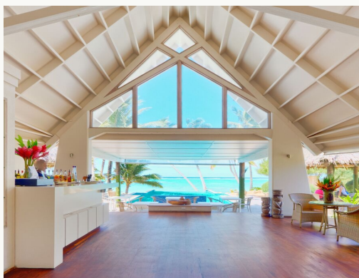
LITTLE POLYNESIAN RESORT