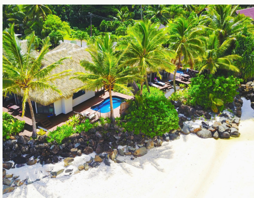
SEA CHANGE VILLAS

Aitutaki is considered the most beautiful lagoon in the world, and here you'll base yourself at your resort and spend time in the beautiful lagoon.