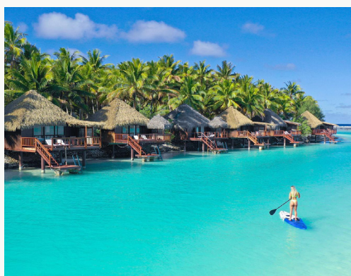
AITUTAKI LAGOON PRIVATE ISLAND RESORT

More options available at: WWW.COOKISLANDS.TRAVEL/WHERE-TO-STAY