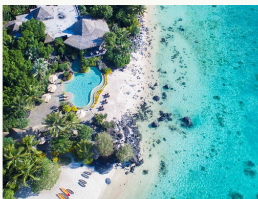
PACIFIC RESORT AITUTAKI