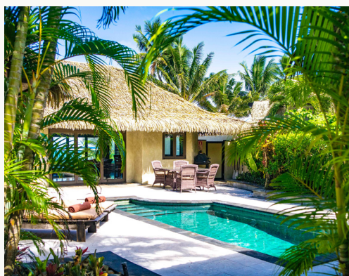
TE MANAVA VILLAS